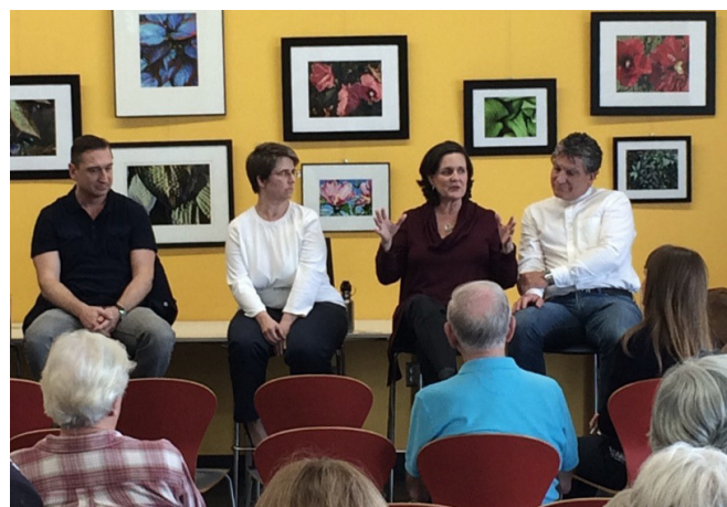
A group of scholars engage book discussion participants as part of the 2017 PLS Big Read

Each of the eleven Pioneer libraries hosted Being Mortal community book discussions featuring scholars from fields such as medicine, counseling, and estate planning. Book discussion participants of all ages felt an emotional connection to the topics, giving positive feedback. One attendee commented that the discussions provided "great information that will assist my family and me." Another participant said "thank you for inspiring the community to have these difficult conversations."