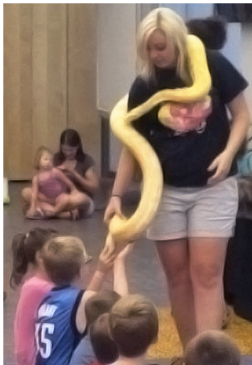
Children learn about exotic animals through hands-on activities thanks to Oklahoma City Zoo

Summer Reading Programs feature something for everyone. Through a partnership with Oklahoma City Zoo, zookeepers bring exotic animals to the libraries to captivate and teach children about nature. Science Museum Oklahoma staff inspire teenagers to explore their imaginations by engineering Rube Goldberg machines and other inventions.