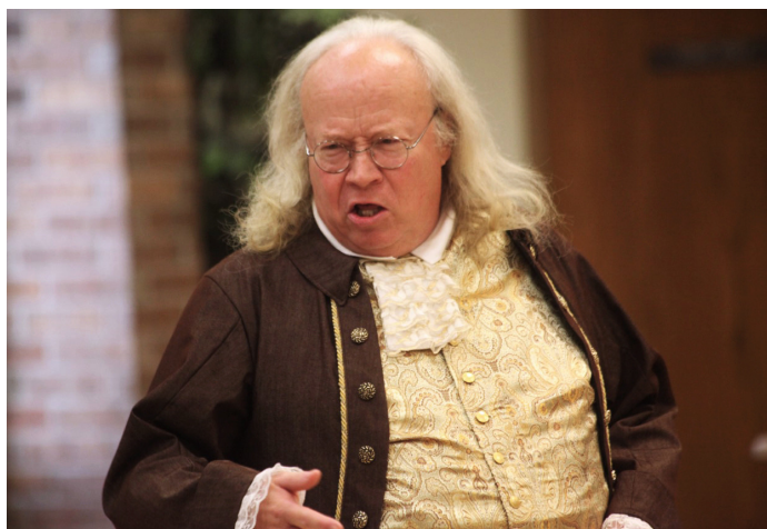
Journey back in time with "Ben Franklin Live!"

People of all ages can immerse themselves in cultural experiences, such as live musical performances by Cimarron Opera and Boulevard Brass, and presentations by Benjamin Franklin (as portrayed by a historical re-enactor).